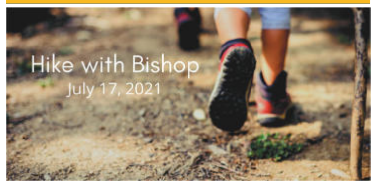
Hike with Bishop July 17, 2021 Labrador Hollow, Tully NY

We will be keeping track of emails if you need anything.