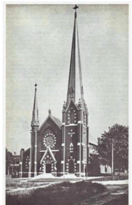
St. Patrick's Church 1890

This Mass will also be offered live on our Fa- cebook page. If you would like to attend please contact the St. Patrick and St. Brigid's parish office Tuesday – Thursday from 9-2 for a res- ervation at 315- 475-2185.